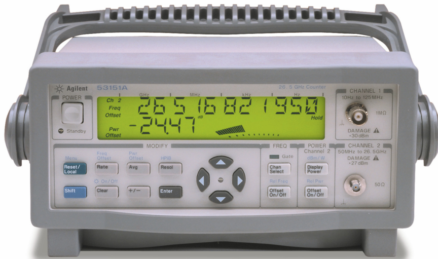
53150A, 53151A, and 53152A